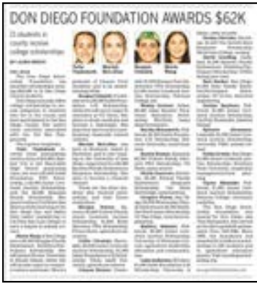
San Diego Union Tribune